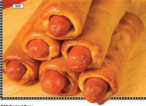
548 Pretzel Dogs

100% beef hot dogs wrapped in our amazing dough. Bake'em in your oven or zap'em in your microwave for a quick and easy snack. 5 - 4 ounce pretzel dogs. $16.00